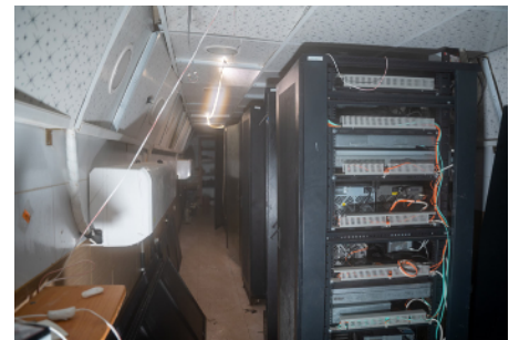
Hamas’ complex located underneath UNRWA’s headquarters in Gaza (Source: Emanuel Fabian/ Times of Israel , Gaza City, February 8, 2024).