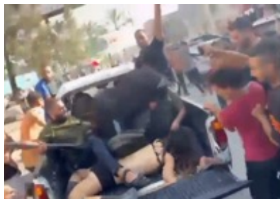
A 22-year-old girl's lifeless and naked body was further brutalized by Gazans as she was paraded through the streets of Gaza with signs of having been raped. She was subsequently beheaded. (Screenshot of Hamas video on Oct. 7)