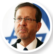
ISRAELI PRESIDENT ISAAC HERZOG OCTOBER 9, 2023

The people of Israel lived through one such moment this weekend [at] the bloody hands of the terrorist organization Hamas – a group whose stated purpose for being is to kill Jews."