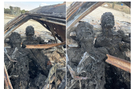
Hamas terrorists burned Israelis alive in their brutal massacre, including civilians who were trying to escape in their car in the community of Be'eri.