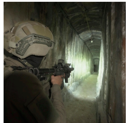
An Israeli soldier shows one of Hamas' terror tunnels found underneath Shifa Hospital in Gaza, on Nov. 22, 2023. Shifa Hospital was used by Hamas to hold Israeli hostages kidnapped during the Oct. 7 massacre, and as a command-and-control center for terror operations.

"The attack of October 7th, the slaughtering of men, women, children, the rocketing of Israel that continues to this day — no country — no country — could accept that. And so Israel has not only the right, as we've said, but the obligation to defend itself."