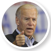
PRESIDENT JOE BIDEN OCTOBER 10, 2023

"There are moments in this life – I mean this literally – when a pure unadulterated evil is unleashed on this world.