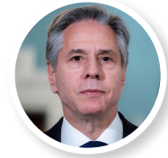
SECRETARY OF STATE ANTONY BLINKEN

As Secretary Blinken said, "Everyone would like to see this conflict end as quickly as possible. But if it ends with Hamas remaining in place and having the capacity and the stated intent to repeat October 7 again and again, that's not in the interests of Israel, it's not in the interests of the region, it's not in the interests of the world."