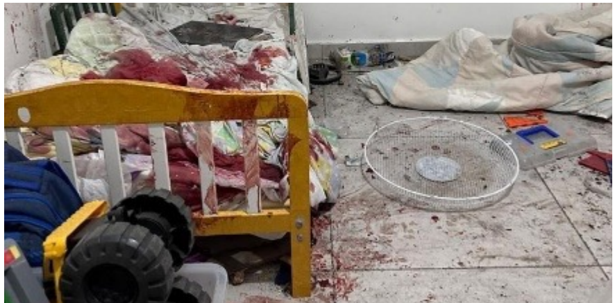
A blood-soaked child's bed in Kibbutz Kfar Aza in the aftermath of the Hamas assault on Israel on Oct. 7.